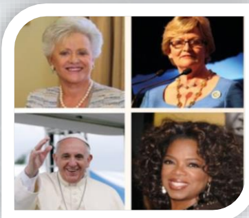
Number of respect guests