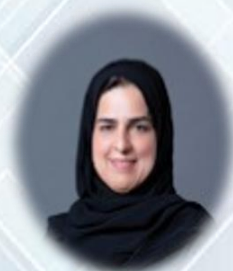
Director of Nursing Department, , Head of National Nursing & Midwifery Committee in the UAE& ENA President

“We must look forward and anticipate the future so that our country leads globally.” Sheikh Mohammed bin Rashid Al Maktoum