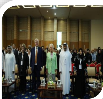
H.H Princess Muna Al-Hussein Princess of Jordan, Global Health Advocate for Nursing and Midwifery

UAE hosted ,The International Council of Nurses (ICN) 2021 Congress ,the largest gathering of nurses from across the world in 2021.this highly interactive meeting provided under the theme “Nursing Around the World”, brought together the world’s nurses and related disciplines to share best practice, research and knowledge.